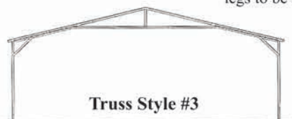
Truss Style #3

$175.00 with 6' legs $10.00 each additional foot in height with purchase of a Carport