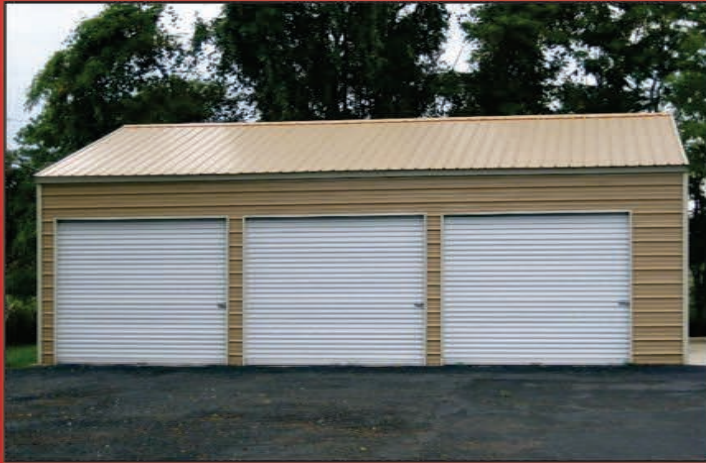
(Vertical Roof, Horizontal Sides and Ends. Photo shown with extra options)